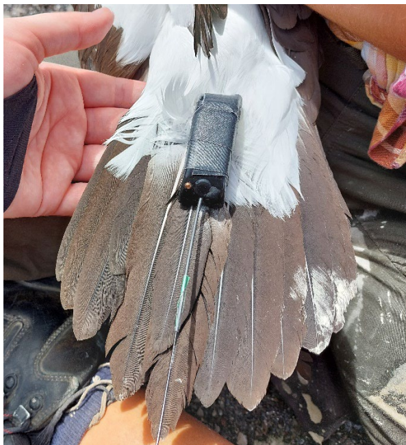
1Masked booby Tav sat tag