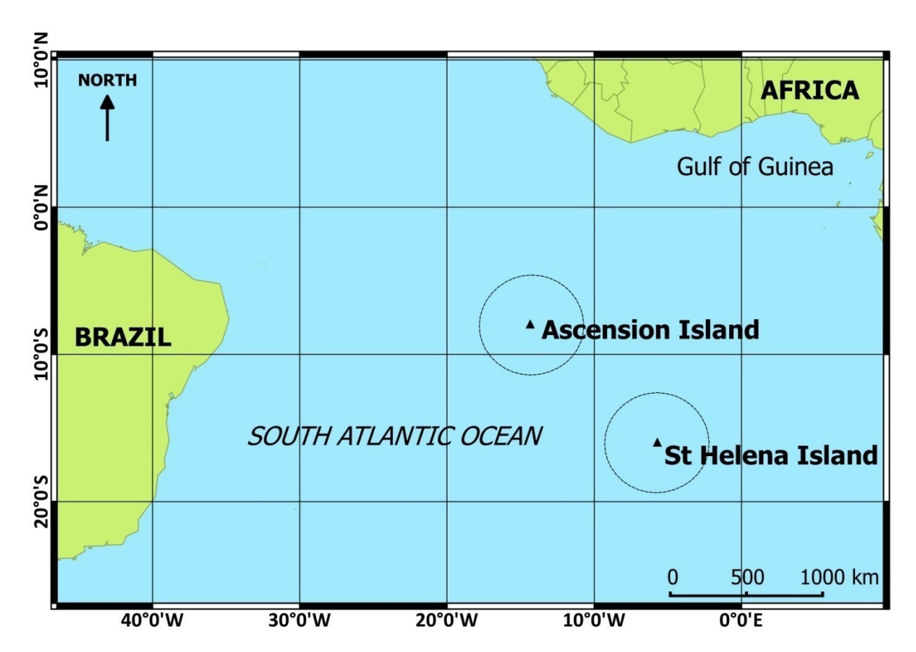
Figure 1. Map showing the location of Ascension Island and St Helena Island in the South Atlantic Ocean. Dashed lines represent the Marine Protected Areas (MPAs).